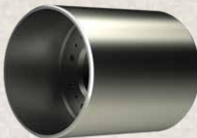
PRESS ON HUB